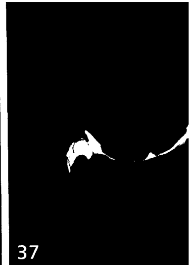
The Skyra fit Experience