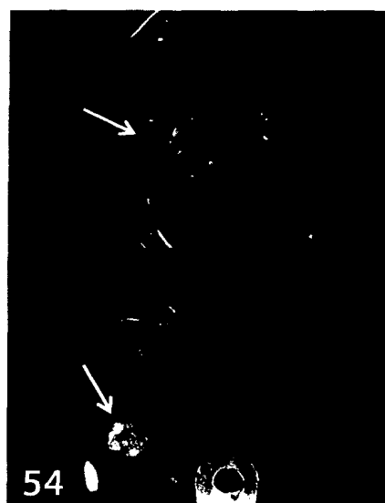
Compressed Sensing GRASP 2