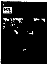
Title: First and Buddy Aid