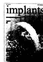
Cover image courtesy of Degradable Solutions AG, www.easy-graft.com