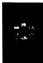
Cover image courtesy of Bicon, www.bicon.com