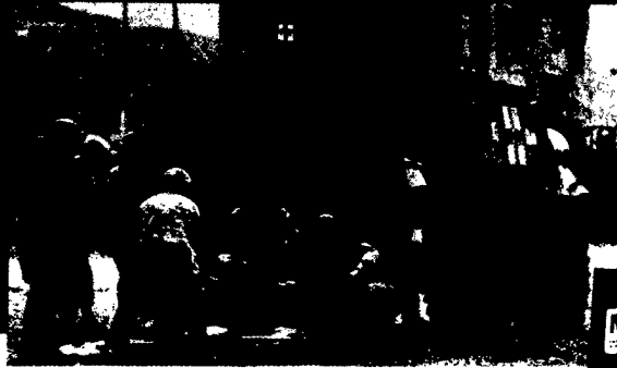
▲ Canadian Bison Armoured Ambulance.