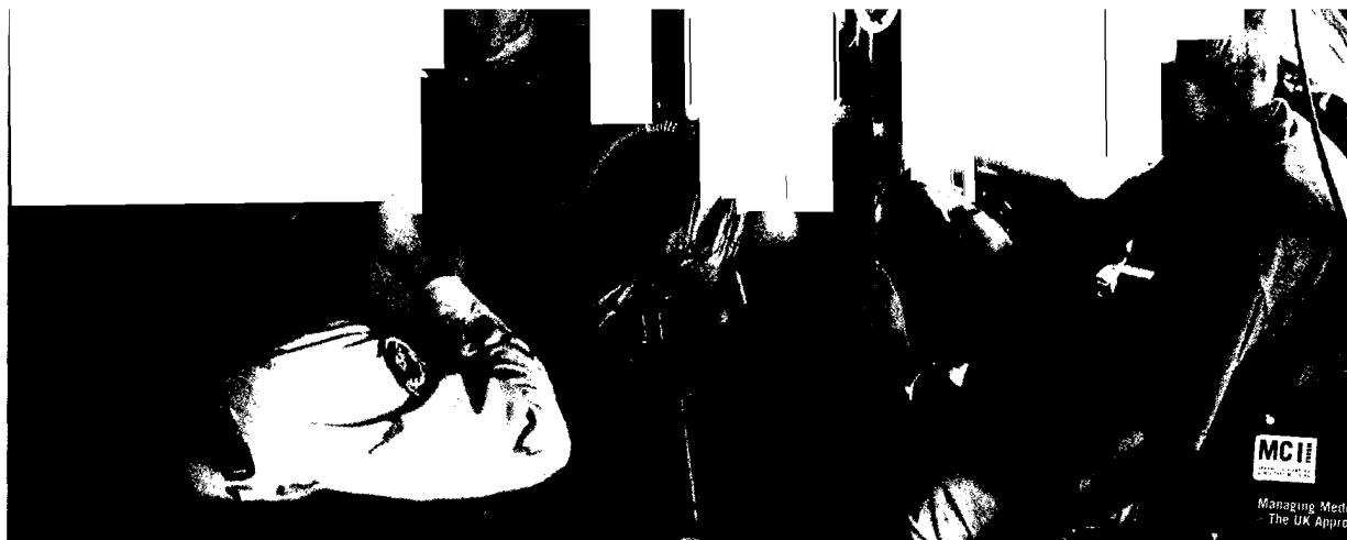
▲ Aeromedical evacuation - onboard intensive medical care